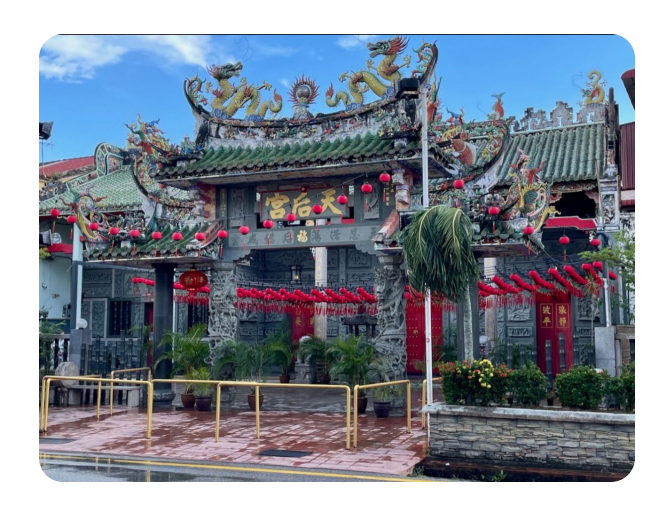
Mosques, Churches, Hindu Temples, and Chinese Taoist Temples - often all in the same areas or close-by each other.

Officially registered people from my country are close to 450,000 in Malaysia. There are also a large amount that are no longer registered or illegal. Most are migrant workers in factories, garment industries, and security guards. They usually work long hours 6 or even 7 days/week. Families aren't allowed, and many live in company hostels with limited access where they must stay. However, there are many small bodies in different areas of the country, usually supported to some degree by local bodies. Trained leadership and discipleship that can speak the language can be hard to come by though, as only a few have any real training and locals don't know the language.