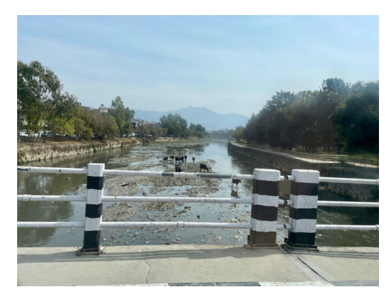
You don't see many stray cows in the roads any more in the city, Evidently they have now taken up living in the main "river" basin. Often even lower water than this and always full of discarded everything, they were happily traveling on down a road of their own making.