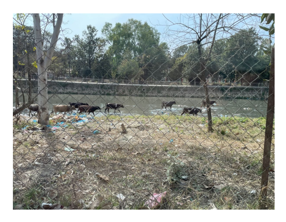
Arriving back in the city isn't usually very exciting to me, especially with all the pollution, dirt, and crowds. But this was a different site!

only not all of it was good. A couple of us got very sick. One gal spent a couple days in the hospital with influenza. I was hit hard with what was most likely COVID- definitely those kind of symptoms. It really threw me for a loop, so I am still in the city almost 3 weeks later than I had planned. I'm still not really up to par (March 18 now), and a bit leery of being able to handle the travels without getting sick again. But I'm hoping that I can make it later this week as the time is really getting away for all that needs to be done.