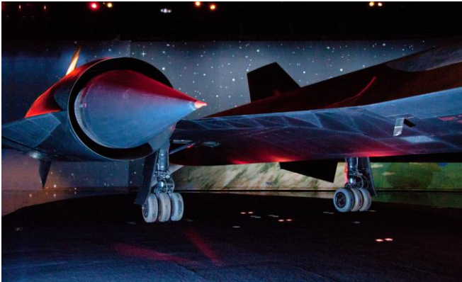
Our speakers' platform was under the fuselage of this Blackbird spy plane!

"If you are a Christian you are not a citizen of this world trying to get to heaven. You are a citizen of heaven making your way through this world." Vance Havner