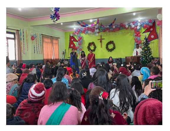
The Christmas program was packed. I'm sure there was well over 100 kids alone. And no, they didn't stay quiet and still for the 3 hours it went! But the time was also packed with the true message for the many who haven't heard before.

Yep, it has been the holiday season ++ here. We started with the local big holidays in October, managed to cook ourselves wild for American Thanksgiving in November, and then the always full Christmas season with the 'Family' the last weeks of December. Adding on a wedding, and a 'clean-up after' night, there were 5 local style feasts in one week during the latest holiday. They definitely know how to do it up big when it comes to food.