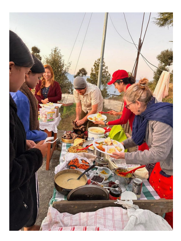
A very unique American Thanksgiving meal with all the fixings. Many of which the 70+ guests had never experienced.