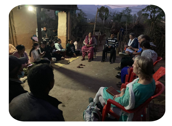
Many sweet times of fellowship together and sharing in different ways.