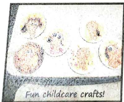
Fun childcare crafts!