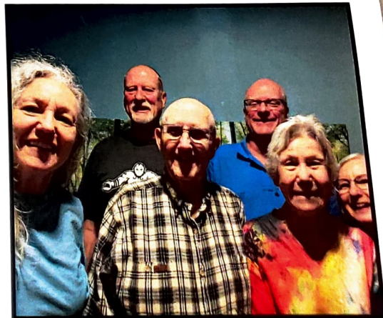
Our Arizona family