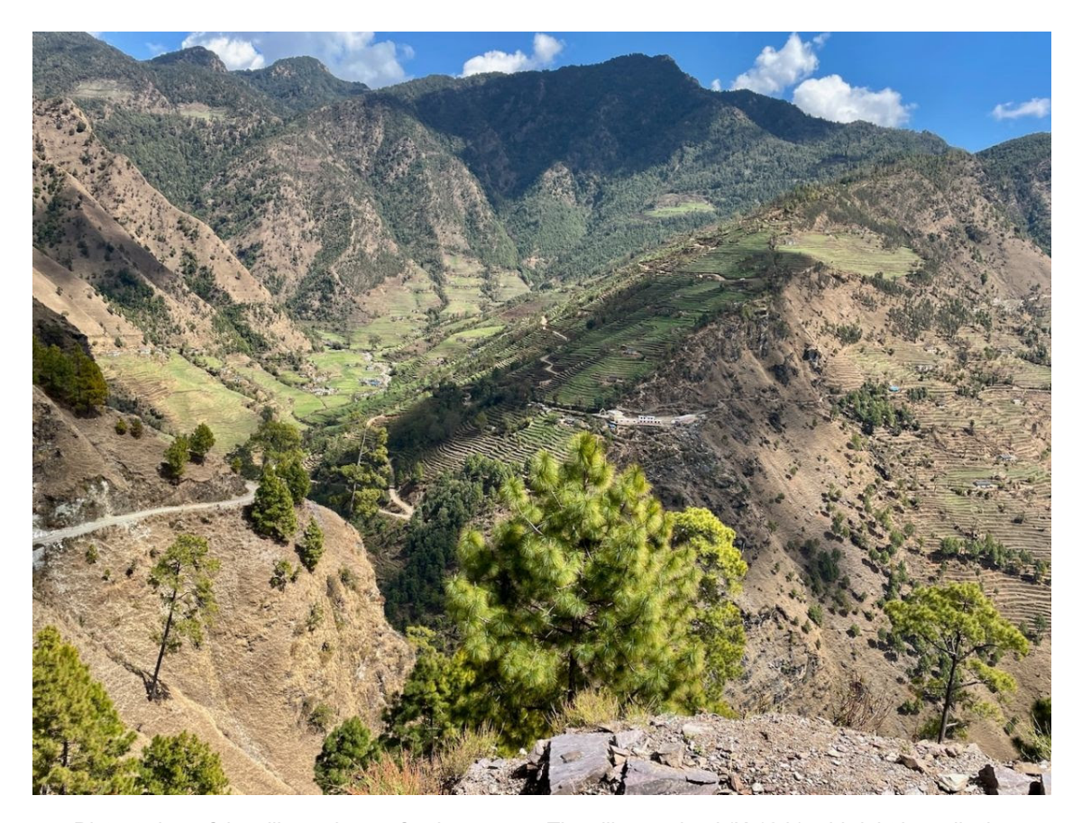
Distant view of the village chosen for the survey. The village school (K-10th) mid-right is really the only community building, except a small 'birthing center'.

have to walk over an hour to the nearest store, health care, or higher level school (11th-college). While the wires are being strung, they still don't have electricity either. But I'll admit what hit me the hardest was general area with over 4000 scattered people has '0' known family members. The nearest small village body took us 2 hours by vehicle (but not an option for most of the time). I'll admit it felt overwhelming. How?? How will they ever have the opportunity - much less the thousands of other communities just as hard to reach in the region? I just had to lift my heart up to the One that loves them and longs for His Body to be in this area. He is up to the job, so looking to Him.