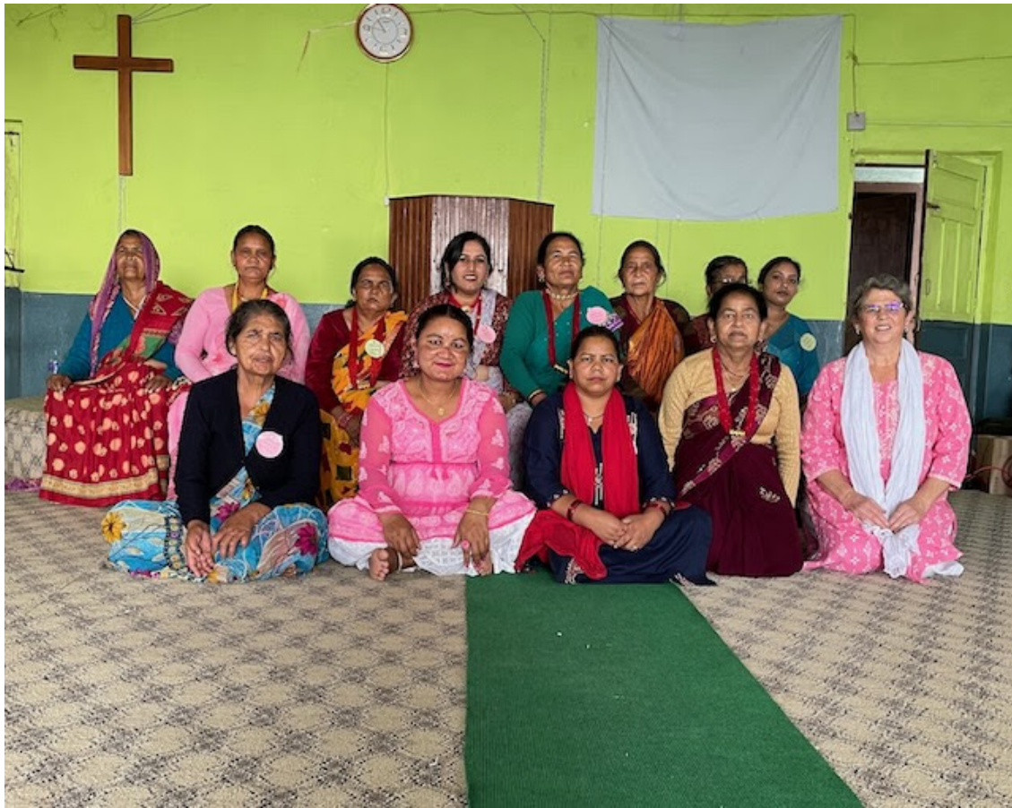
A few of the ladies pose for a picture after our special event.