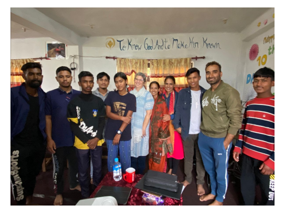
The whole gang the final day of teaching

Enjoying teaching and sharing in their lives