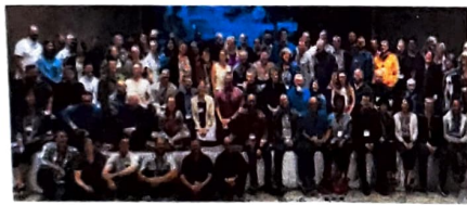
Ethnos360 graduates in leadership worldwide.